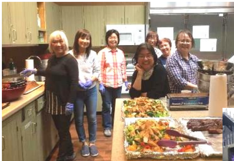
Ronald McDonald House - prepared meals for the families of cancer patients.